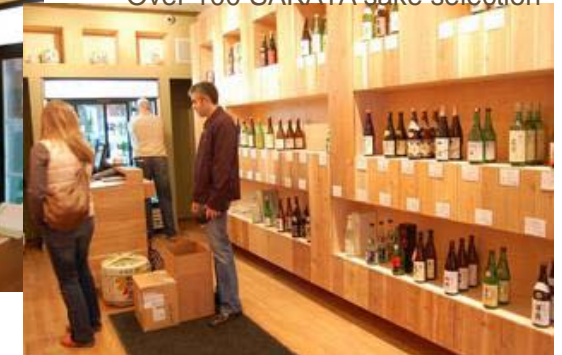
Over 100 SAKAYA sake selection