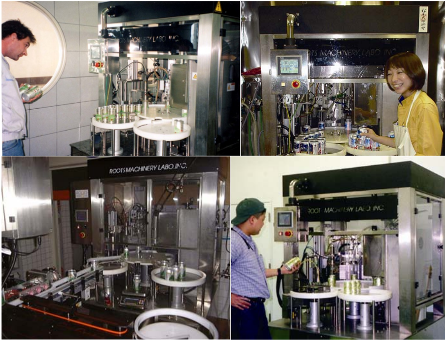
Thanks to its very compact monoblock design and one man operation feature, "Beer Radix" is very nice solution not only for laboratory use but also for small scale commercial production. Over 10 units of "Beer Radix" are used at craft beer breweries in Japan to produce canned beer.