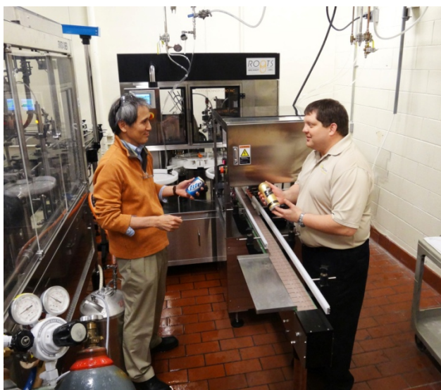
"Beer Radix IV" at MillerCoors pilot plant in Milwaukee, WI, USA. "Three head water rinser" is integrated in front of the Beer Radix.

■ Can be used for beer and carbonated beverages. We can design and build various canners for laboratory use.