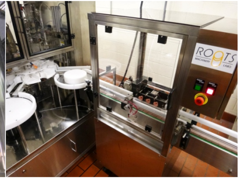
Option: Three head water rinser / blower with conveyor. Date coding on the bottom (ink jet) is also available.