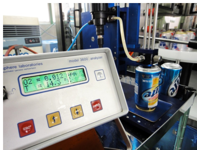
No-filler-bowl design and independent under-cover-gassing station makes very low air pick up.